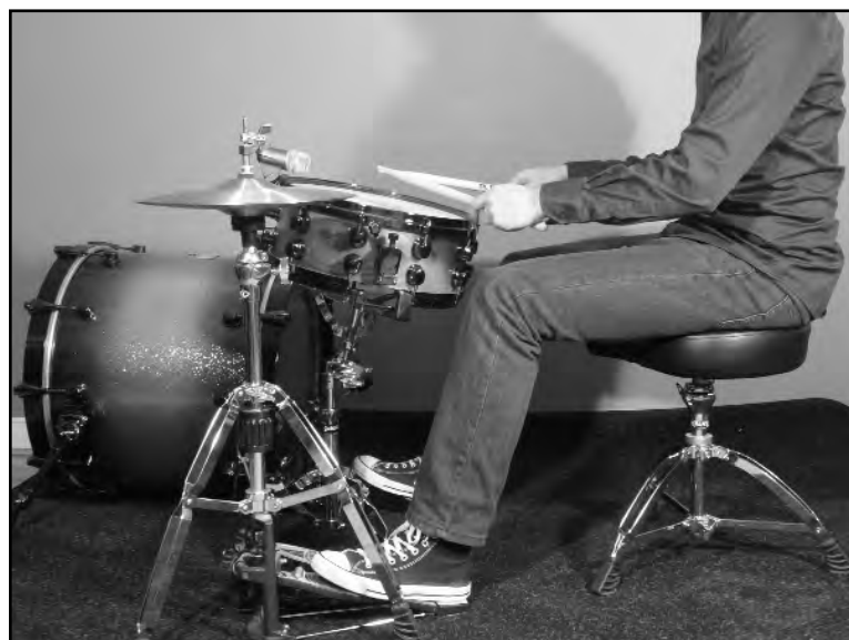
Fig. 3: Sitting too far away