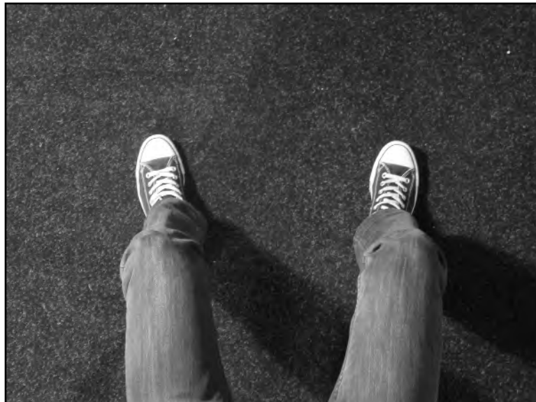
Fig. 4: Relaxed foot position

When relaxed, most people sit with their feet positioned like this (Fig. 4):