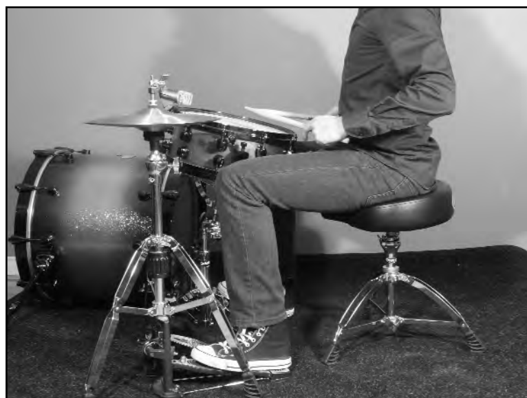
Fig. 2: Sitting too close