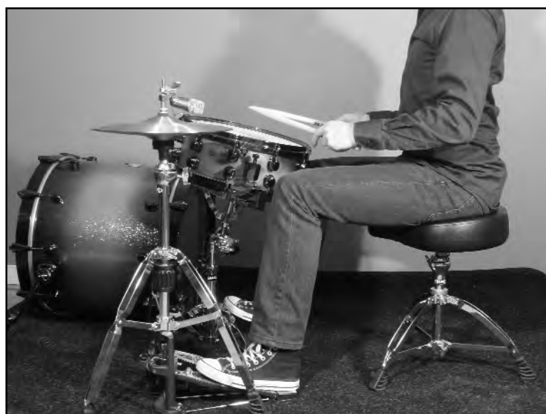
Fig. 1: Relaxed leg position

The distance you sit from the pedals has a tremendous effect on your playing. Look for the most relaxed position of your leg, and tailor your setup to this position. For most people, the thigh and lower leg create an angle slightly greater than 90 degrees when they are relaxed (Fig. 1). This position eliminates stretching and tension. Sitting too close to the drums (Fig. 2) causes the drummer to “pull back” and stretches the muscles of the upper thigh. This can be very fatiguing over time. Some drummers get into this position by trying to set all their drums up under them, instead of at a relaxed distance. Someone sitting too far from the pedal (Fig. 3) is wasting energy stretching their leg muscles and wasting work in the lateral direction as they try to play the pedal.